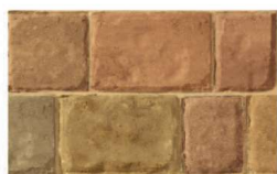
Autumn Gold (AG)