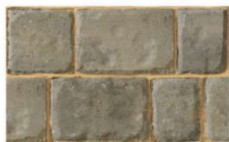
Silver Haze (SH)

Add AG/SH/RB to the product code to specify the colour. For example the code for a Regatta TRIO 60mm in Silver Haze (SH) from our South East factory at Cliffe would be RGTC60SH.