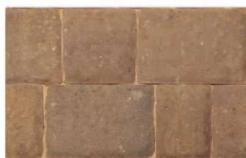
Rustic Bronze (RB)